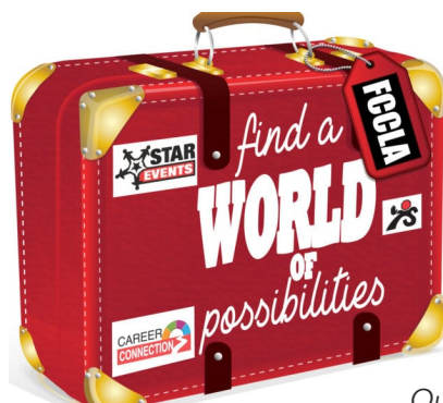
Our New State Theme Logo!