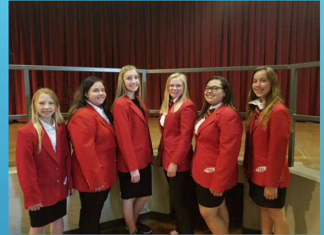
Northern Area Officers