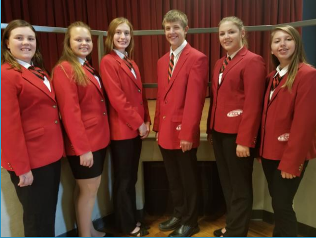
SouthWest Area Officers