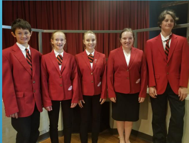
SouthEast Area Officers