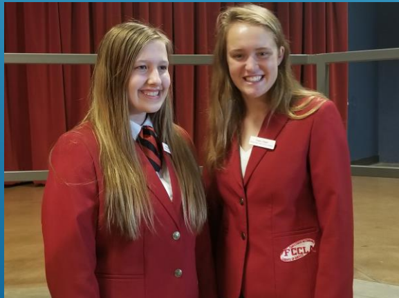
Central East Area Officers