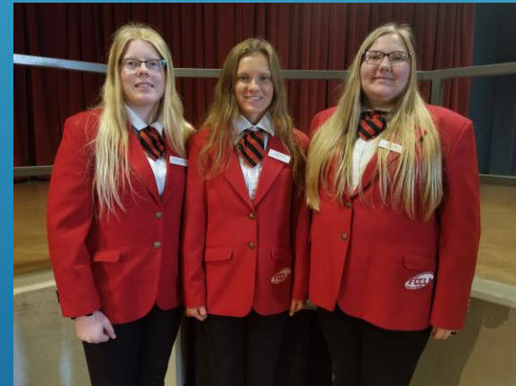
Central West Area Officers