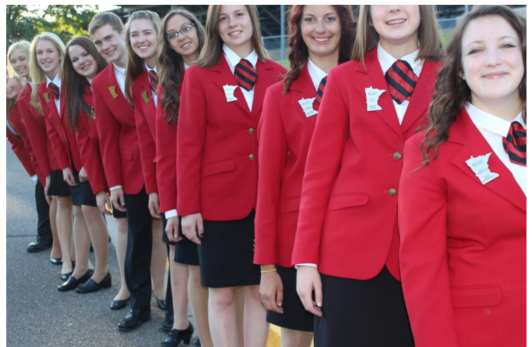
State Officers continue to work on their state theme and plans for State FCCLA Conference